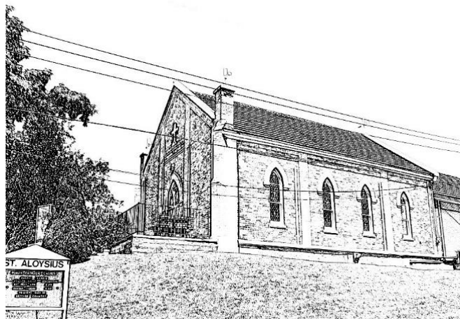
ST. ALOYSIUS CHURCH