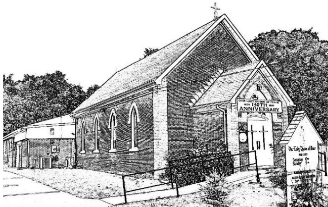
OUR LADY QUEEN OF PEACE CHURCH 18 NEED STREET, BOBCAYGEON

Mission: To show the love of Christ through discipleship, fellowship, and worship.