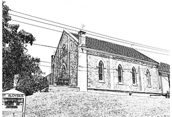
ST. ALOYSIUS CHURCH 41 JOHN STREET, FENELON FALLS