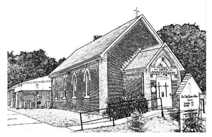
Mission: To show the love of Christ through discipleship, fellowship, and worship.

OUR LADY QUEEN OF PEACE CHURCH 18 NEED STREET, BOBCAYGEON https://ladyqueenofpeacebobcaygeon.ca/