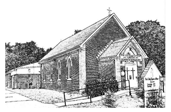
OUR LADY QUEEN OF PEACE CHURCH

Mission: To show the love of Christ through discipleship, fellowship, and worship.