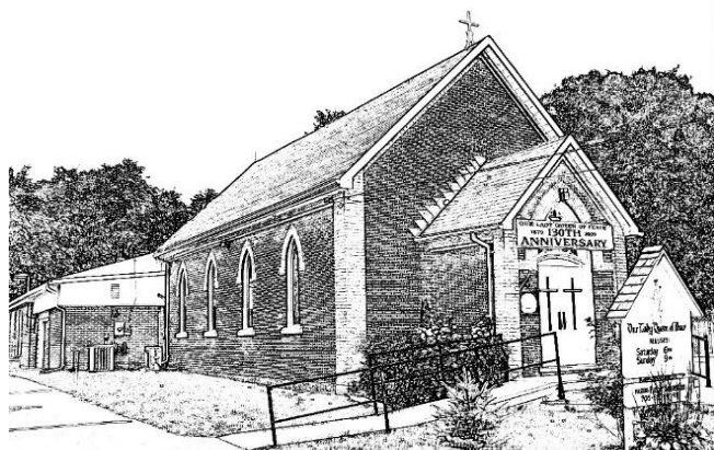
OUR LADY QUEEN OF PEACE CHURCH

Mission: To show the love of Christ through discipleship, fellowship, and worship.