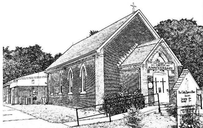
OUR LADY QUEEN OF PEACE CHURCH

Mission: To show the love of Christ through discipleship, fellowship, and worship.