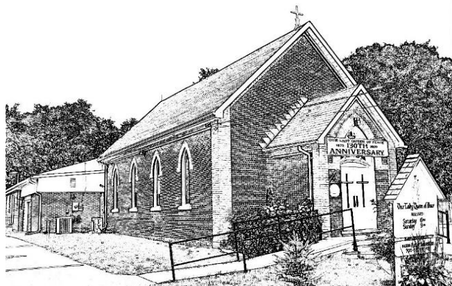
OUR LADY QUEEN OF PEACE CHURCH

Mission: To show the love of Christ through discipleship, fellowship, and worship.