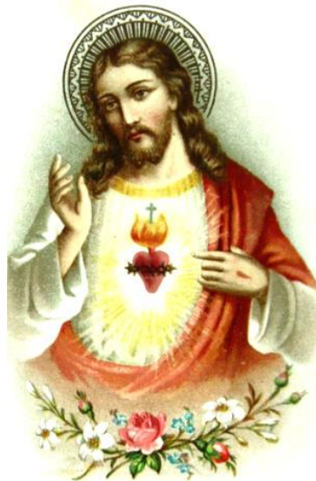
SACRED HEART OF JESUS

We pray that all those who suffer may find their way in life, allowing themselves to be touched by the Heart of Jesus.